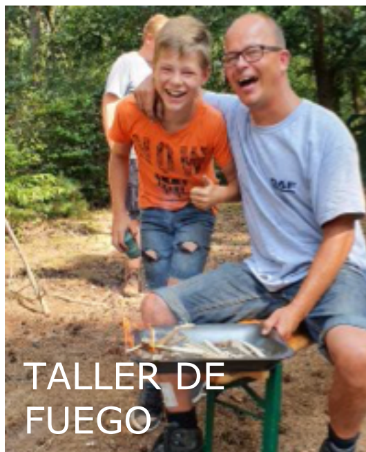
TALLER DE FUEGO

The development of ecological values is vital for the well-being of the people