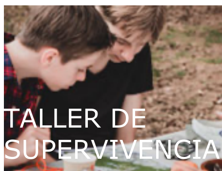
TALLER DE SUPERVIVENCIA

Identification of fauna and flora, most common types of tracks, orientation techniques with map, compass and elements of the environment.